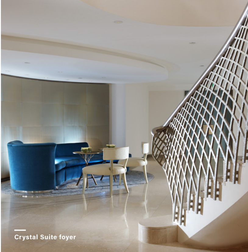
Crystal Suite foyer