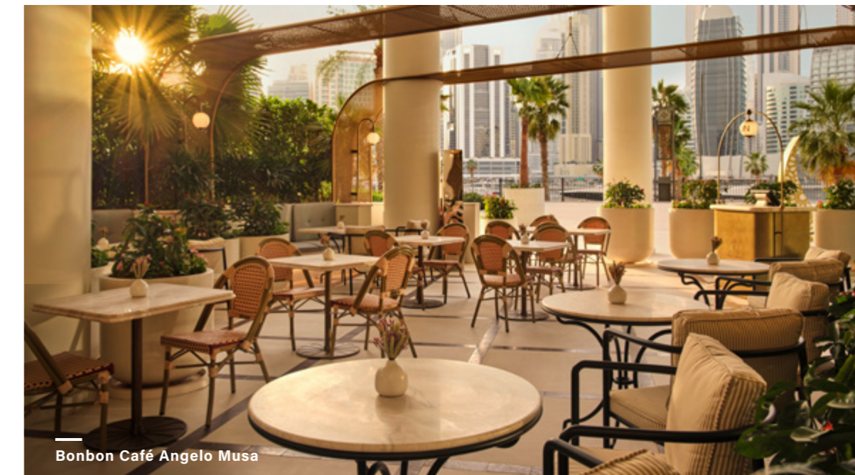
Bonbon Café Angelo Musa

Located on the 29th floor, our beautiful spa combines Dior's prestigious treatments with timeless, calming design for the ultimate wellbeing experience. Its privileged views gaze out over Downtown Dubai and the Burj Khalifa.